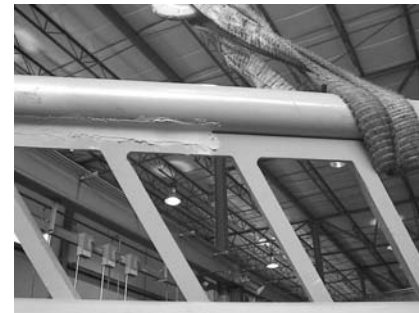
Lab-metal is applied with a putty knife to finish a rough weld. The hardened Lab-metal is then sanded smooth, providing a paintable, permanent metal finish.

Spray painting Lab-metal, to rustproof large surface areas: An internal mix spray head should be used, set at roughly 65 pounds of air pressure to eliminate clogging. For larger quantities, an agitator tank should be used (consult spray equipment dealer). Clean the gun thoroughly with Lab-solvent immediately after use. When applying Lab-metal in closed areas (such as tank interiors), proper ventilation must be provided and NIOSH approved self-contained breathing apparatus should be used. Any striking of metal on metal that could cause sparks must be avoided.