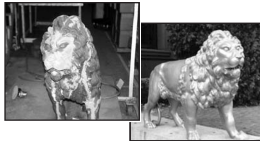
Before and After: Hi-Temp Lab-metal was used to patch cast iron lion statues in an historic restoration project.

Hi-Temp Lab-metal is recommended where original Lab-metal may not withstand the extreme heat. Originally developed to meet foundries' core box repair needs, industries such as metalworking, powder coating, welding, fabricating, heating, construction, auto repair, die casting, mold refinishing, and sheet metal production and finishing now rely upon Hi-Temp Lab-metal.