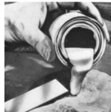
Lab-metal spreads like paste and hardens into metal. Application tip: wet the applicator with Lab-solvent to aid in smoothing the Lab-metal and reduce "pulling".

Lab-metal's unique formulation allows for three methods of application: spreading, brushing or spraying. Instructions for each of the three methods follow: