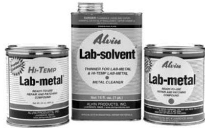
Hi-Temp Lab-metal (withstands temp's to 1000°F), Lab-solvent (thinner, metal cleaner), and Lab-metal (for repairs to 350°F or one-time exposures to 425°F).

Lab-metal may also be thinned to paint consistency with Lab-solvent and brushed or sprayed on practically any surface – including wood and cement – to provide a rustproof, water resistant, hard metal finish.