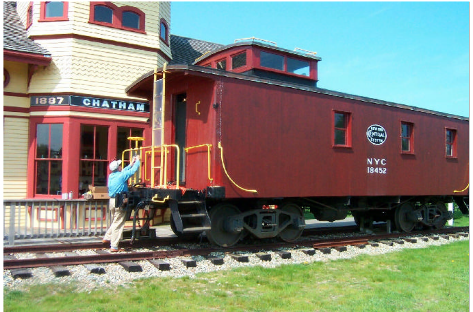
At the Chatham Railroad Museum, Alvin Products' Lab-metal was used to fill and patch areas pitted by corrosion.

After allowing the second layer of Lab-metal to harden, the rails were sanded and a new coat of yellow paint was applied.